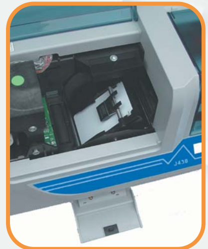
Integral flip-over unit for dual-sided printing